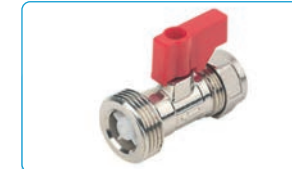
Washing machine/dishwasher isolation valve with built in check valve

It may be worth checking your isolation valve as it may have been adjusted to reduce high pressure.